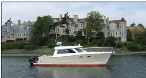
Buzzards Bay 33

The first production-built Buzzards Bay 33 was launched in Halifax, NS in July. The 33' power catamaran is built by North Atlantic Yachts for Multihull Development of Plymouth, MA. The boat made her maiden voyage to Plymouth in some rough conditions and performed beautifully, maintaining a cruising speed of 18-20 knots in 4-6ft seas. The BB33 is powered by twin 225 hp Mercury Verado outboards and has a top speed of 34 knots. All who were aboard during sea trials marveled at how quietly and smoothly the vessel performed. The second BB33 is powered by twin Steyr diesels with Mercruiser sterndrives, and a third boat is on order for an owner in Wisconsin.