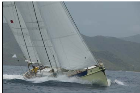
'Maggie B'

Congratulations to all - you've done Nova Scotia proud!